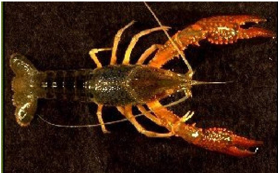
Figure (1). Different pictures of Procambarus clarkii