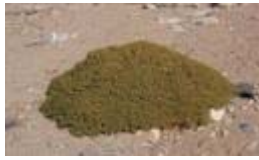
GEPA economic plants