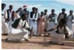
GEPA local community